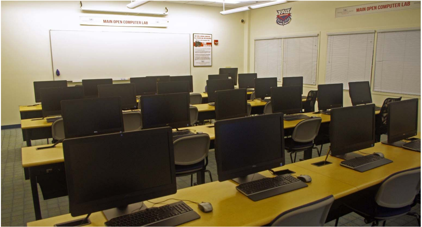
FAU Jupiter Campus Open Computer Lab | LB-105A