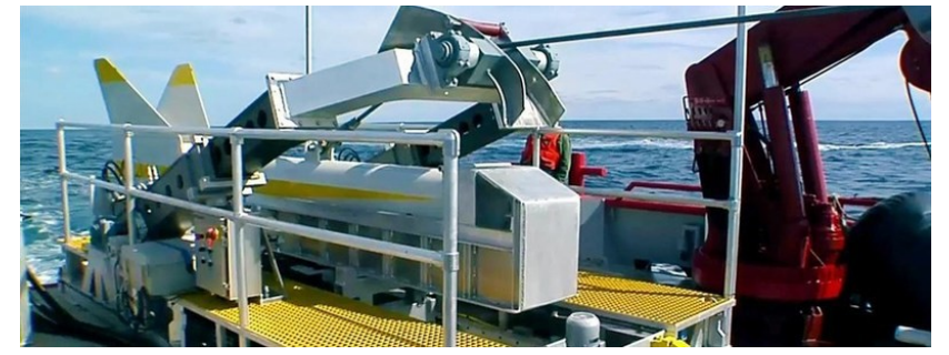
Raytheon and FAU Harbor Branch perform developmental testing. The Littoral Combat Ship Variable Depth Sonar deployed and recovered at sea.

The U.S. Navy selected and awarded a $27.9 million contract to Raytheon Company to provide the new Variable Depth Sonar (VDS) submarine warfare asset. Designed and built in partnership with FAU Harbor Branch, the VDS will be deployed from Littoral Combat Ship (LCS) to locate and track enemy submarines.