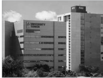
Fort Lauderdale Campus - Downtown