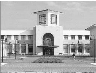
John D. MacArthur Campus