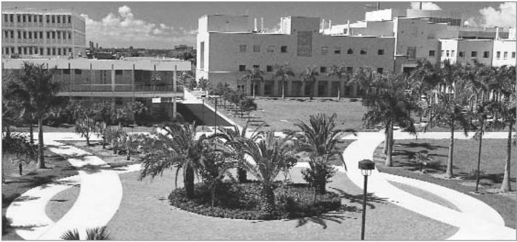
Boca Raton Campus