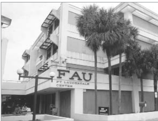
Commercial Boulevard Campus

Originally established as an upper division and graduate university, FAU accepted its first freshman class in 1984. The University is now home to eight colleges: the College of Architecture, Urban and Public Affairs; the Dorothy F. Schmidt College of Arts and Letters; the College of Business; the College of Education; the College of Engineering and Computer Science; the Harriet L. Wilkes Honors College; the Christine E. Lynn College of Nursing; and the Charles E. Schmidt College of Science. The University additionally provides older adults with educational opportunities through the unique Lifelong Learning Society, one of the largest programs of its kind in the country. FAU has developed an on-line curriculum to provide degree programs to students using the Internet anywhere in the world. A comprehensive research university, FAU offers undergraduate programs in 60 fields of study and master's degrees in 53 disciplines. The University confers 17 doctoral degrees ranging from a doctorate in nursing to a Ph.D. in ocean engineering.