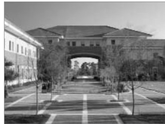
Treasure Coast Campus