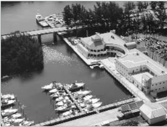
Dania Beach Campus

Dedicated to teaching, research and public service, FAU has a significant economic impact on the South Florida community and is one of the area's largest employers with more than 4,500 full-and part-time employees. Nearly 1,500 scholars serve on FAU's faculty, including 12 who hold prestigious Eminent Scholar chairs. Sponsored research totaled more than $50 million for fiscal year 2004, including significant funding for FAU's ocean engineering, nursing and brain science programs.