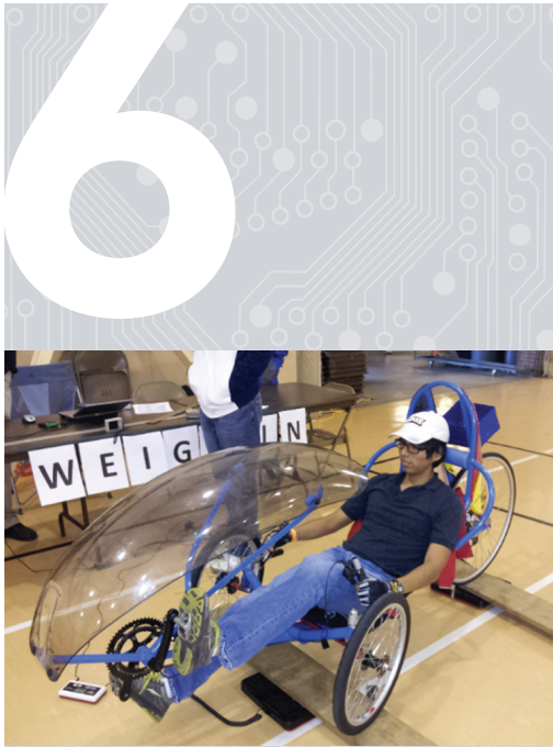
Undergraduate Statistics 2011-2012