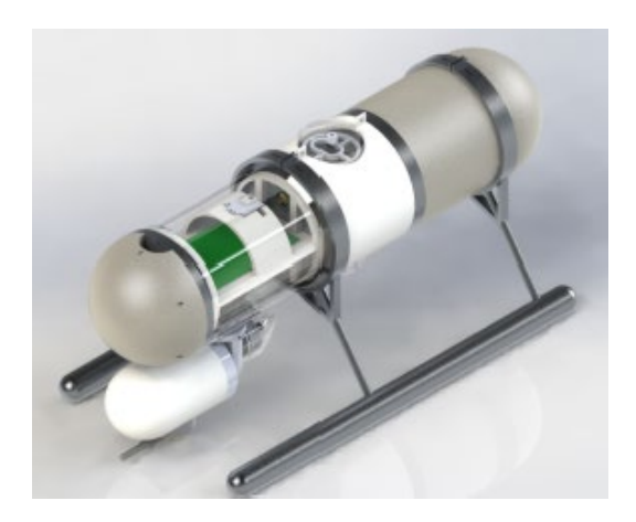
Figure 3. Bio-Inspired Autonomous Underwater Vehicle to Detect, Track and Follow a Surface Moving Object.