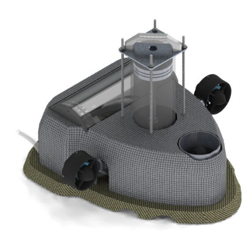
Figure 4. Bio-Inspired Self-Burying Autonomous Underwater Vehicle.