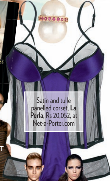
Satin and tulle panelled corset, La Perla, Rs 20,052, at Net-a-Porter.com