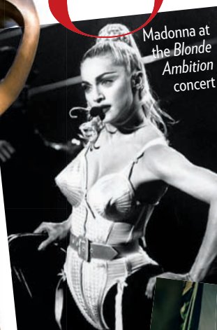
Madonna at the Blonde Ambition concert