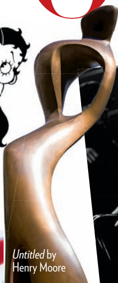
Untitled by Henry Moore