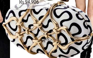
'Minaudière' printed silk clutch, Emilio Pucci, Rs 94,906

MOVIESTORE COLLECTION; REX FEATURES; GETTY IMAGES; DVAIPAYAN MAZUMDAR; KIM WESTON-ARNOLD; KEDAR NENE; FOTOCORP