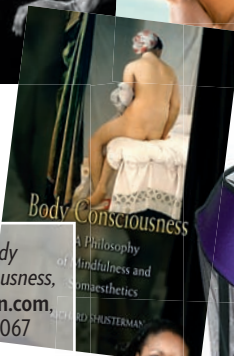
Body Consciousness, amazon.com, Rs 1,067

T hink sculpting your body with second-skin clothing, from high-waisted trousers or leggings to bodysuits. If the thought of shrink-wrapping yourself is scary, note that fashion's return to old Hollywood seduction has made body-con more contemporary and 'less spandexy' to create the illusion of shapeliness. Go ahead, channel Betty Boop's impish sexuality or recall Madonna's Blonde Ambition corset power. Body-con can be versatile and fun! Look out for Hervé Léger bandage dresses and do the skinny with Roland Mouret, Balmain and Emilio Pucci!